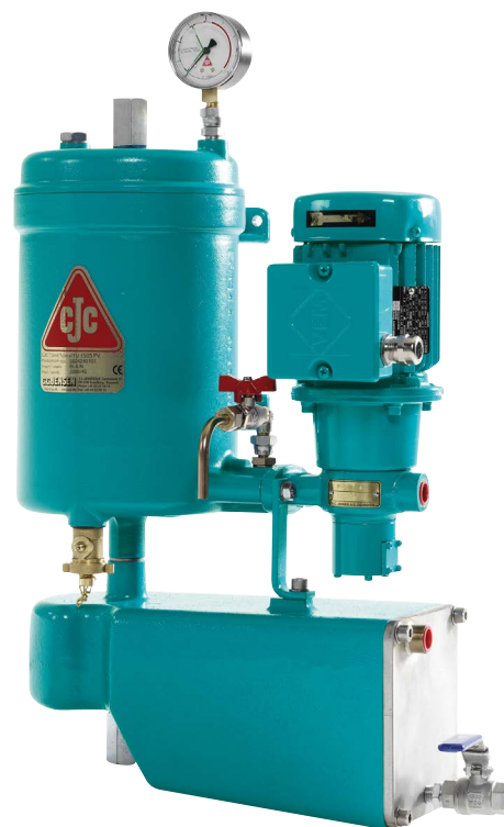
The CJC® Filter Separator PTU 15/25 PV

Preheating the oil before filter pass may be necessary to prevent segregation of paraffin, but only with blended fuels.